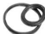
Buna Coated Ring