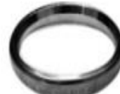
RX Type Ring