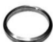
BX Type Ring